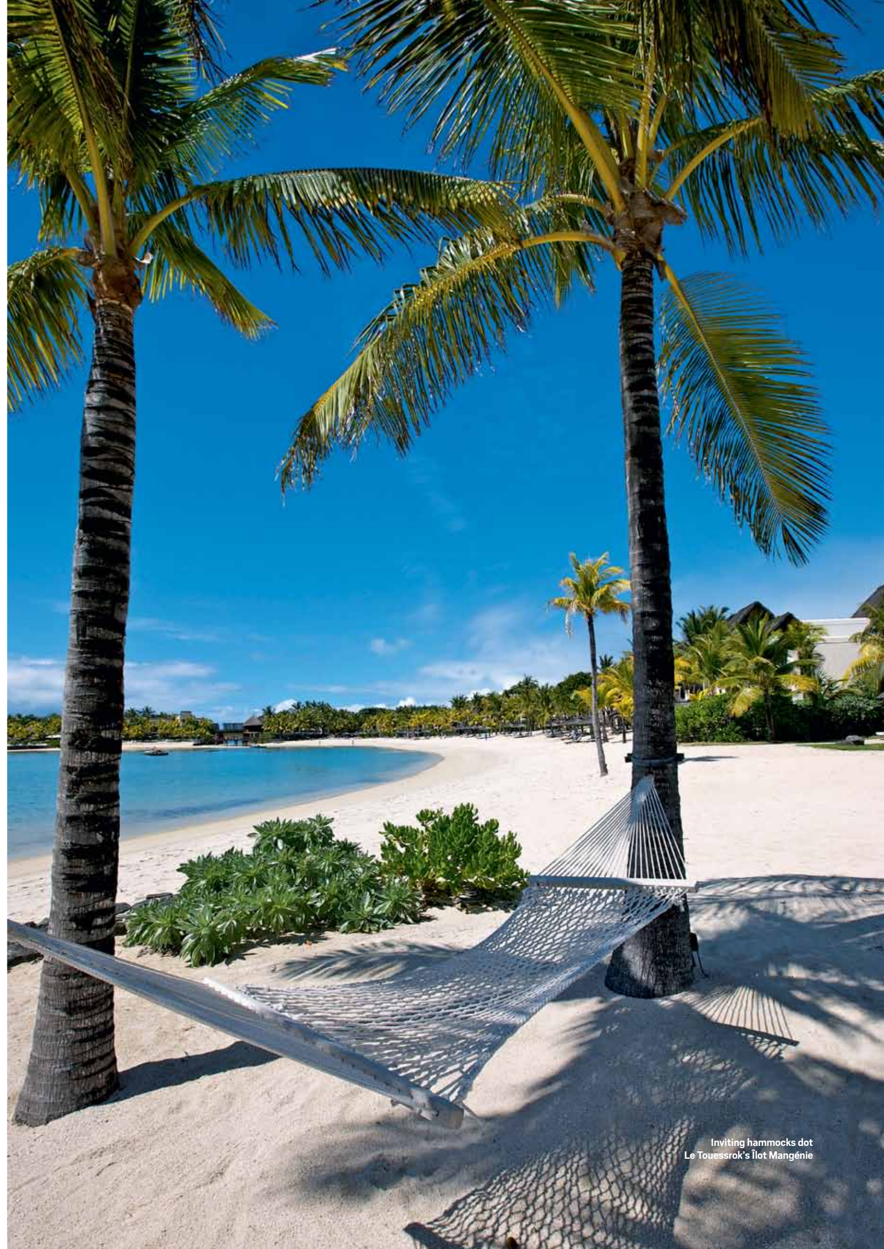
Inviting hammocks dot Le Touessrok’s Îlot Mangénie

French Creole is the most widely spoken language in the island nation, though the culture and cuisine are heavily influenced by the island’s South African neighbours and the large Indian population. As this heady cultural cocktail suggests, Mauritius is far more than your standard island paradise — it bursts with the surprising and unexpected at every turn, and retains the characteristics of all those who have called it home. Here, adventures abound, whether you seek them or not.