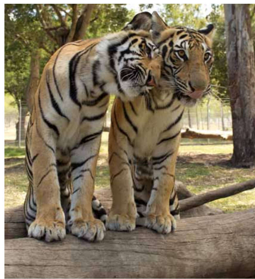
Wild things (right) An affectionate pair of tigers at Casela Nature & Leisure Park

traditional music and dancing is a spectacular way to round off the trip.